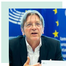
Mr Guy Verhofstadt, Member of the European Parliament

The Joint Presidency is supported by an Executive Board , which is co-chaired by the three institutions.