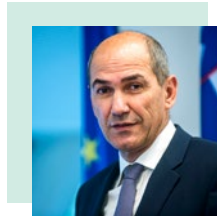
Janez Janša, representing the rotating Presidency of the Council of the European Union